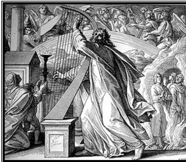
(Psalmist David, by Gustav Doré)

Loyola Institute for Spirituality http://catholic-resources.org