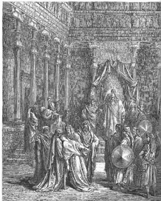
ESTHER BEFORE THE KING

Then . . . she stood before the king . . . and he was very dreadful . . . and the queen fell down, and was pale and fainted . . . (Esther [Apocrypha] 13:6,7)