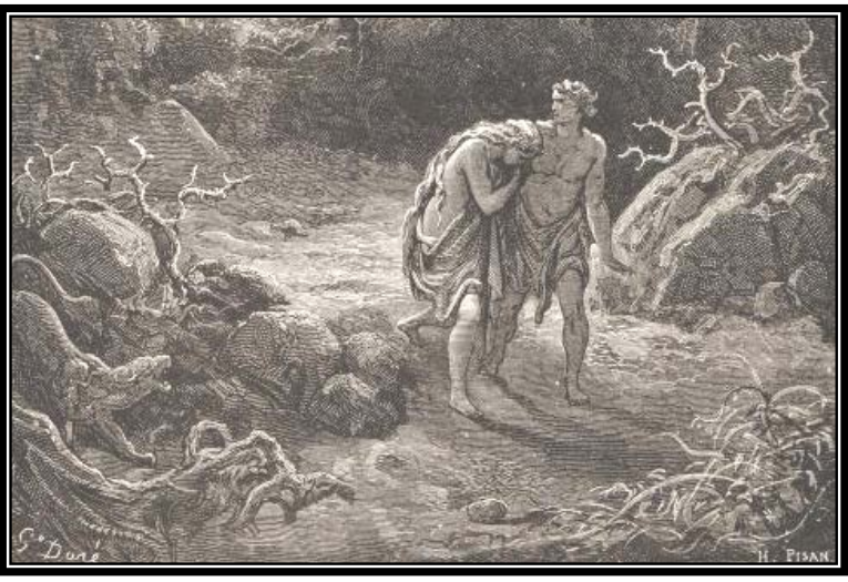
(Expulsion from the Garden, by Gustav Doré)

Loyola Institute for Spirituality <u>http://catholic-resources.org</u>