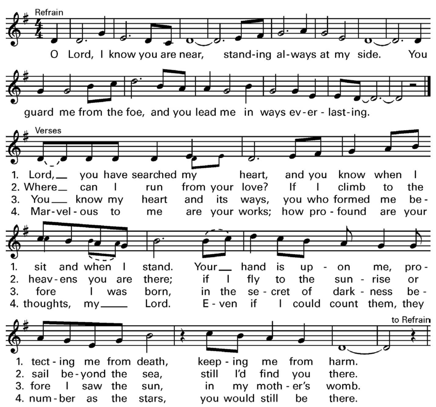
Text based on Psalm 139. Text and music © 1971, 2008, OCP. All rights reserved.